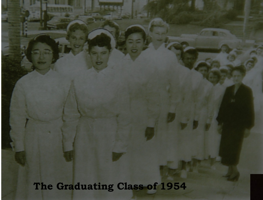
The Graduating Class of 1954

of the Studio for Southern California History, to ensure that the history of the school and its